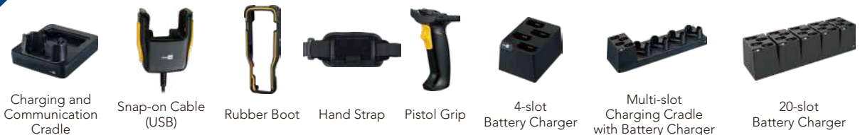
Charging and Communication Cradle