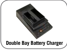
Double Bay Battery Charger