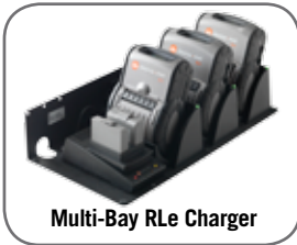
Multi-Bay RLe Charger