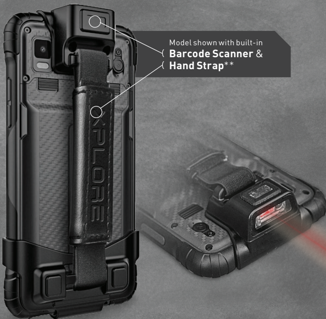
Model shown with built-in Barcode Scanner & Hand Strap**

Standard 1-year warranty covers all product or manufacturing defects. Expanded warranties available for accidental damage coverage.