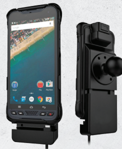
Vehicle Charging Cradle