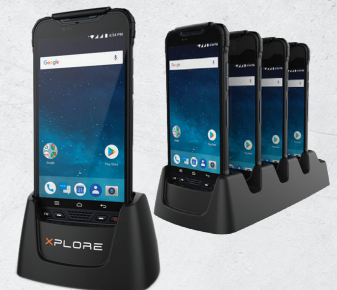
Desktop and Multibay Charger