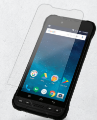
Screen Protector (3-Pack)