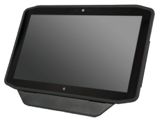
SlateMate Data Acquisition Mobile (Barcode Reader and High Frequency RFID)