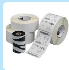
Consumables (labels, ribbons, PVC cards)